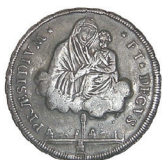
Silver ten paoli coin, minted in Bologna in 1796