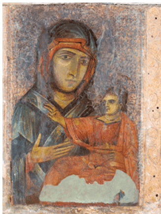
Byzantine icon dating back to the 10th-11th centuries, restored in the 12th and 13th centuries and venerated on the hill La Guardia since the end of the 12th century.